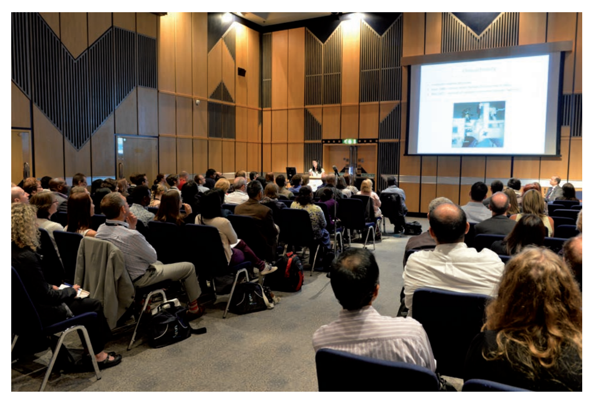
Members attend an IBMS CPD credited event

To find out more about IBMS membership benefits visit: www.ibms.org/benefits