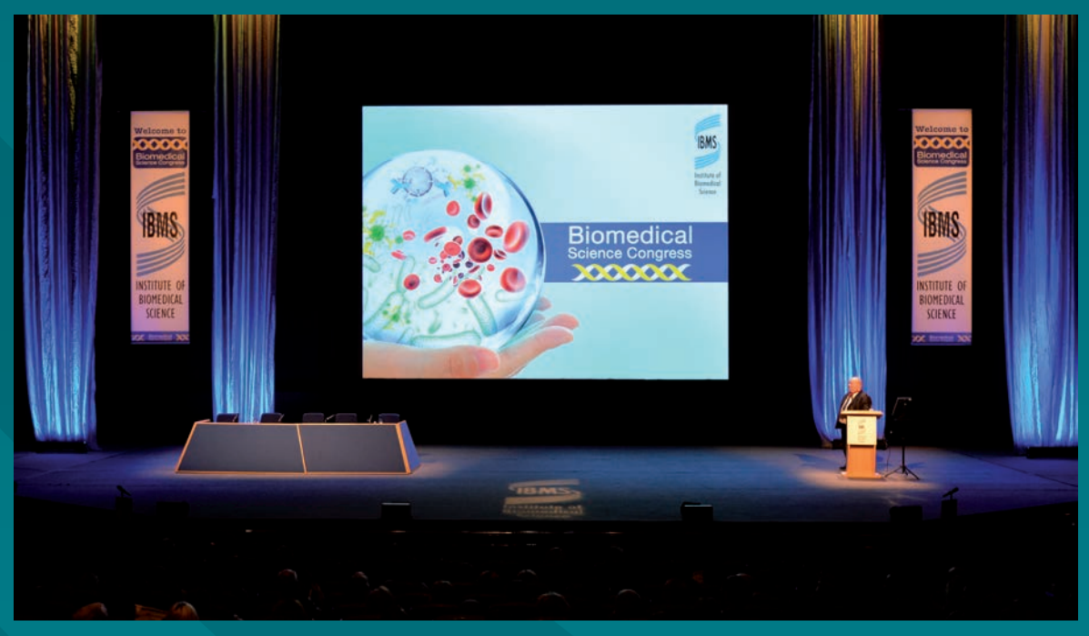
IBMS Congress, September 2013