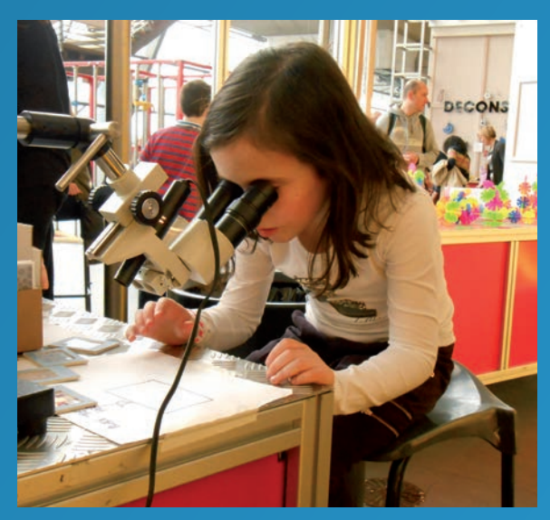
A budding young scientist at the IBMS Scotland events at the Meet the Secret Service of the NHS