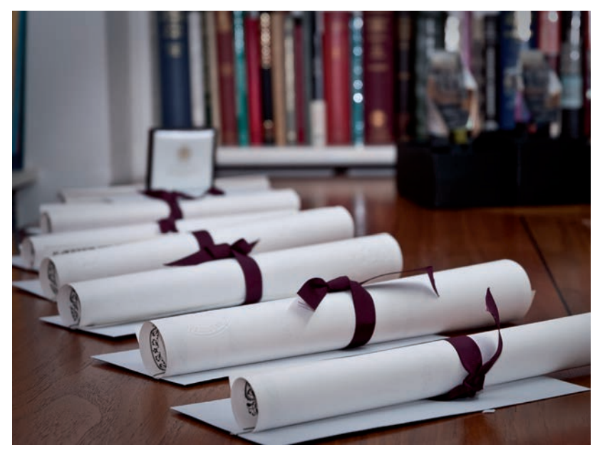
President's Prize certificates and 50 year medal presented at our 2013 AGM